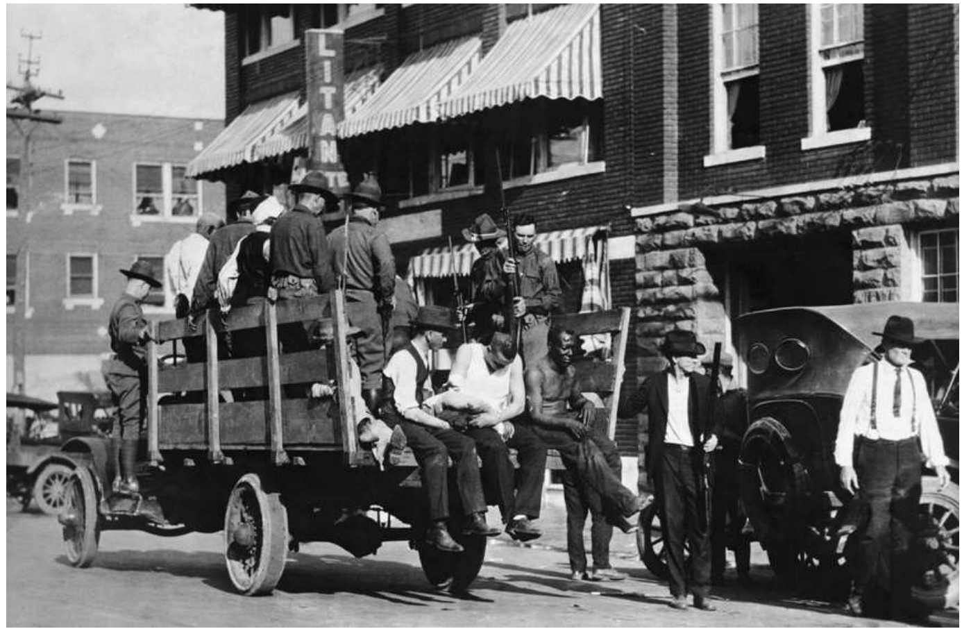
In the spring of 1921, a white mob leveled "Black Wall Street" in Tulsa, Oklahoma. Here, wounded prisoners ride in an Army truck during the martial law imposed by the Oklahoma governor in response to the race riot.

A commission authorized by the Oklahoma legislature produced a report affirming that the riot, the knowledge of which had been suppressed for years, had happened. But the lawsuit ultimately failed, in 2004. Similar suits pushed against corporations such as Aetna (which insured slaves) and Lehman Brothers (whose co-founding partner owned them) also have thus far failed. These results are dispiriting, but the crime with which reparations activists charge the country implicates more than just a few towns or corporations. The crime indicts the American people themselves, at every level, and in nearly every configuration. A crime that implicates the entire American people deserves its hearing in the legislative body that represents them.