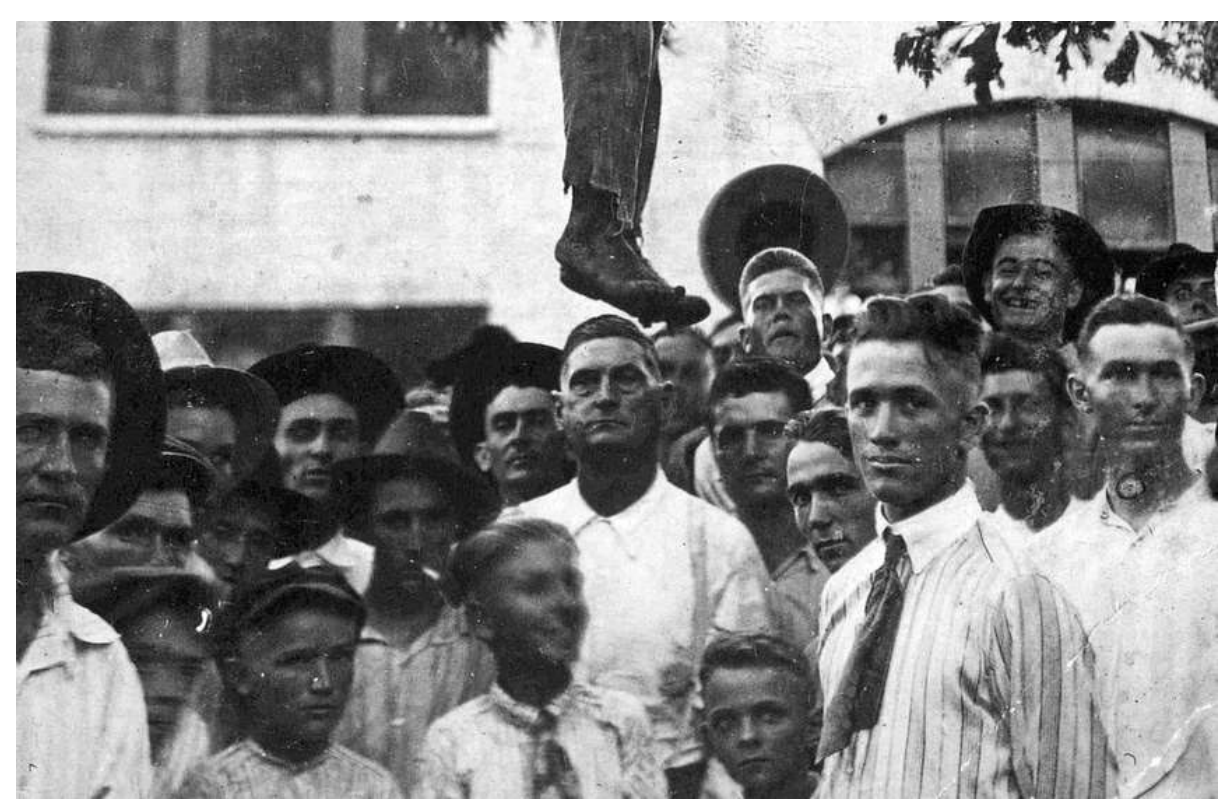
A postcard dated August 3, 1920, depicts the aftermath of a lynching in Center, Texas, near the Louisiana border. According to the text on the other side, the victim was a 16-year-old boy.

blacks continued into the 1920s—in 1921 a white mob leveled Tulsa's "Black Wall Street," and in 1923 another one razed the black town of Rosewood, Florida—and virtually no one was punished.