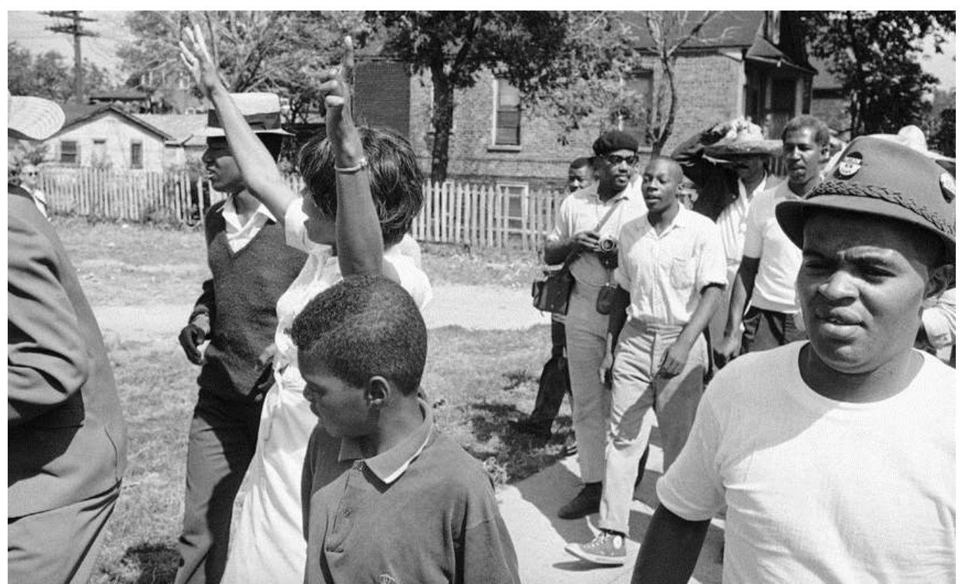
The September 1966 Cicero protest against housing discrimination was one of the first nonviolent civilrights campaigns launched near a major city.

Cicero, 20 minutes or so west of downtown Chicago, attacked an apartment building that housed a single black family, throwing bricks and firebombs through the windows and setting the apartment on fire. A Cook County grand jury declined to charge the rioters—and instead indicted the family's NAACP attorney, the apartment's white owner, and the owner's attorney and rental agent, charging them with conspiring to lower property values. Two years after that, whites picketed and planted explosives in South Deering, about 30 minutes from downtown Chicago, to force blacks out.